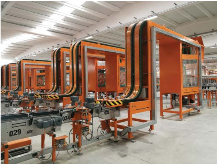
MSK bottle conveyor systems are made from stainless steel and premium components to ensure long life.