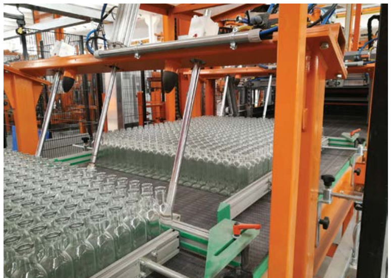
The swivel-arm MSK Triotech palletising system, in combination with the company's Unitech universal head process up to three layers every minute.