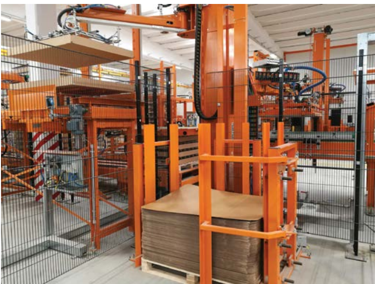
The MSK palletising systems are also equipped with three fully automatic traymakers, a central intermediate sheet inserter and cover sheet/tray inserter, as well as a wooden frame inserter.

maintenance and ensures very low energy consumption.