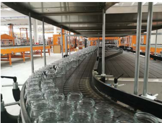
Bottles and jars are transported on three bottle conveyor lines to the palletisers.

With the MSK Multitech shrink-wrapping system, the cold end in Malatya has a compact, high performance and flexible solution. The system is equipped with two film formats and makes it possible to package up to 60 pallets every hour. The compact design with lowerable machine head at the working level and maintenance-free time belt technology allows for simple and quick ▶