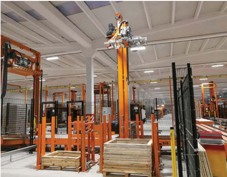
MSK delivered all equipment for the cold end, starting from the Lehr, all the way to pallet packaging from one source and as a turnkey installation.